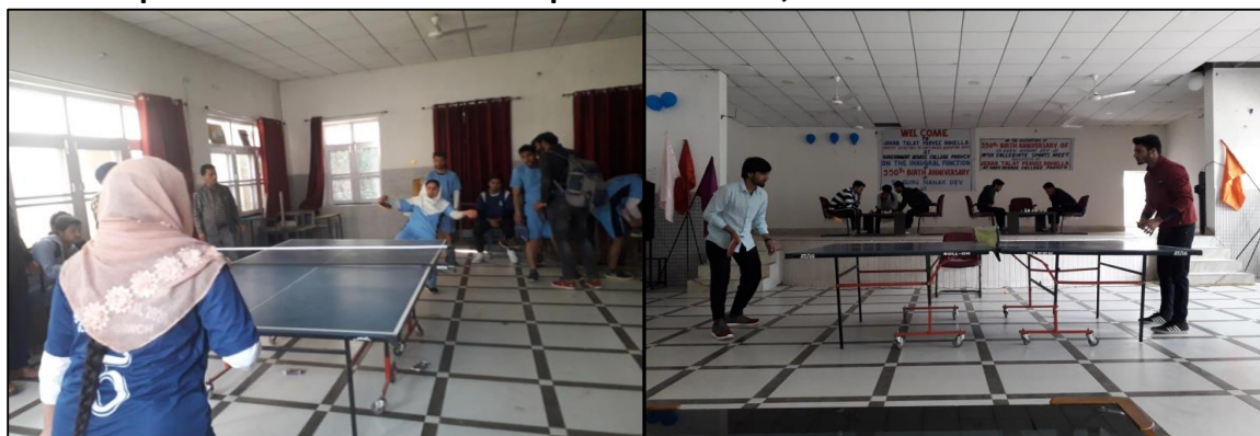
Table Tennis (Women) total 02 teams participated viz GDC Poonch and GDC Mendhar. Winner up GDC Poonch and Runner up GDC Mendhar, Feb 2020.

total 02 teams participated viz GDC Poonch, GDC Mendhar. Winner up GDC Poonch and Runner up GDC Mendhar.